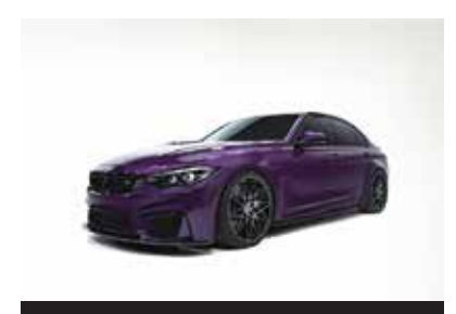
PAINT PROTECTION FILM

XPEL FUSION PLUS Ceramic Coating adds depth, improves shine and surface clarity while protecting your vehicle from the elements with its super hydrophobic formula. All designed to withstand years of driving.