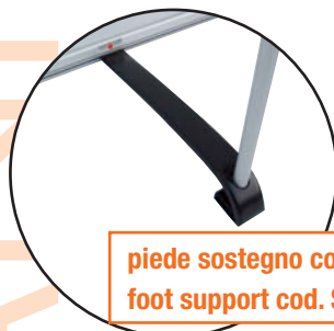
piede sostegno cod. S-L-3 foot support cod. S-L-3