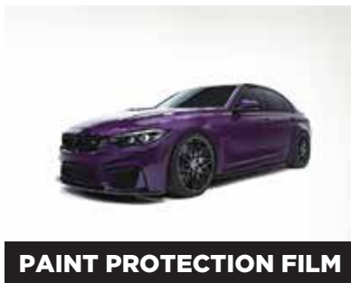
PAINT PROTECTION FILM

XPEL FUSION PLUS Ceramic Coating adds depth, improves shine and surface clarity while protecting your vehicle from the elements with its super hydrophobic formula. All designed to withstand years of driving.