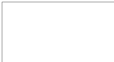
3735-50 Diffuser film