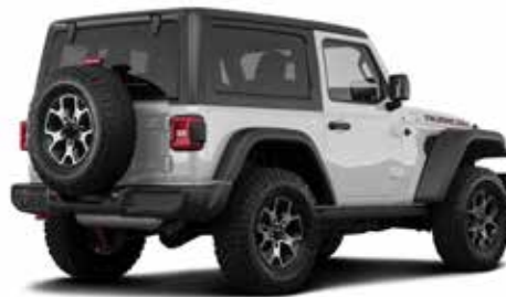
Plastic & Trim

XPEL FUSION PLUS PLASTIC & TRIM Ceramic Coating adds ease of mind with protecting your vehicles plastics and trim. All designed to withstand years of protection.